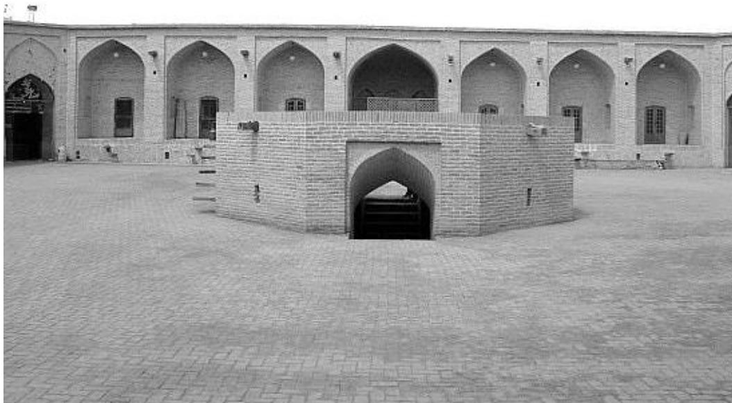
View of a renovated caravanserai

The architecture of the caravanserais was diversified and in addition to the four-porch caravanserais, mountainous, circular, octagonal and desert types were built according to the geographical and spatial location. During the Zandieh, Afshari and Qajar dynasties, the construction of caravanserais continued as before. In terms of design and layout, the caravanserais of the former mentioned periods are generally of the four-porch type and in terms of construction materials, Unlike the earlier period, which was made of brick and stone, clay was often used.