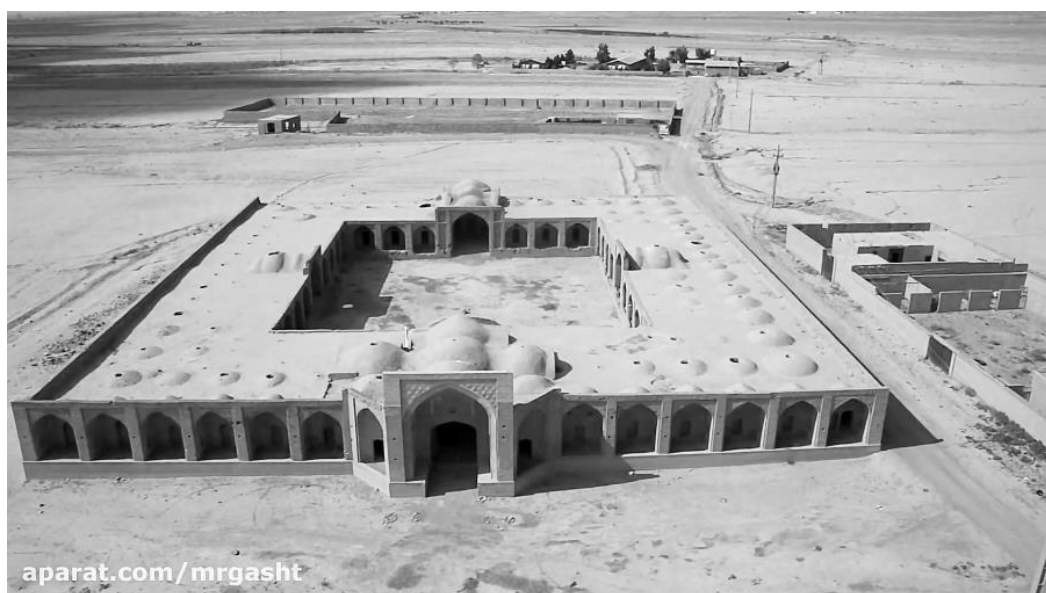
Shah Abbas caravanserai, Ivanaki